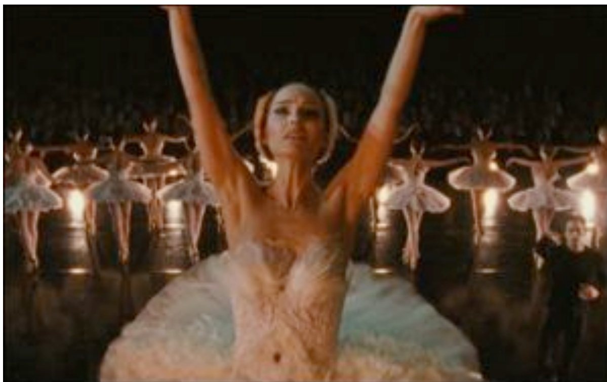
Figure 9: Nina's swan song and deliverance in the ‘stage/womb’

Queer horror becomes a powerful space in which the confluence of performance, creativity and sex demonstrate the ‘art of being’, the rethinking of the Monstrous Other as a symbol of liberation beyond the abject and the queering of normative structures (Fromm 1992). The interfusion of the classic images of ‘soft’ femininity present in the swan and ballerina with the monstrous, leads to a unique creation of a monstrous sublime. Upon becoming the Black Swan and death, Nina finally finds a voice which has been silenced all her life and sings her ‘swan song’, immortalising her image as a creature of bewildering fascination.